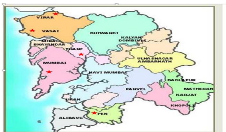
Figure 3: MGP Distribution Centres in Mumbai Metropolitan Region

each being located in Vile Parle (W), Thane, Vasai, Palghar, and in Pen. Each of these centre cater to the consumers residing in the geographical areas closest to service. The process of distribution and collection of requisition and payments remains the same. Every month on an average around 94 grocery items are offered to the member consumers. About 20% of the high consumption items like wheat, wheat flour are repeated every month but less consumed items like pulses, toiletries, personal care products are repeated after two or three months. Members fill in their requisitions and make the computations of their monthly item wise bills, as the approximate prices for each item is clearly mentioned in the requisition.