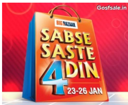
Figure 5: Big Bazaar Sale Offer

Similarly all Ecommerce websites like Amazon Now, Flipkart, Big Basket offer various schemes to attract consumers. Whether these schemes make economic sense or not, the schemes can be quite disruptive for low cost models like MGP distribution model. There are other household items that require periodic purchases like clothes, bed sheets, pillow covers, disinfectants, soaps and toiletries, fresh produce, fruits and vegetables, wet groceries, etc., which is not available at MGP as a result of which the consumer has to use other available options. At these times, the consumers also end up buying the products offered by MGP elsewhere.